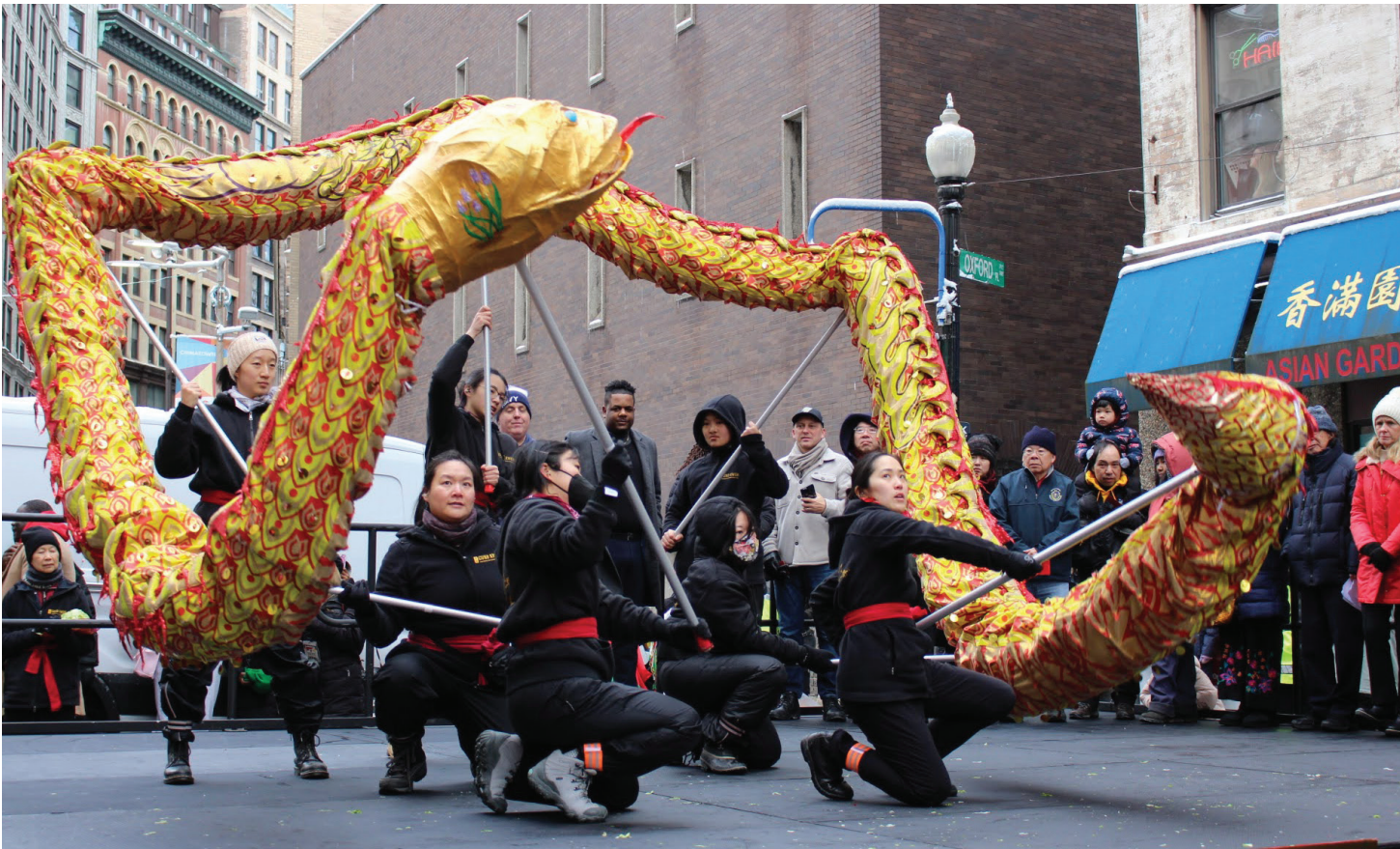
YEAR OF THE SNAKE: Gund Kwok Asian Women's Lion and Dragon Dance troupe.