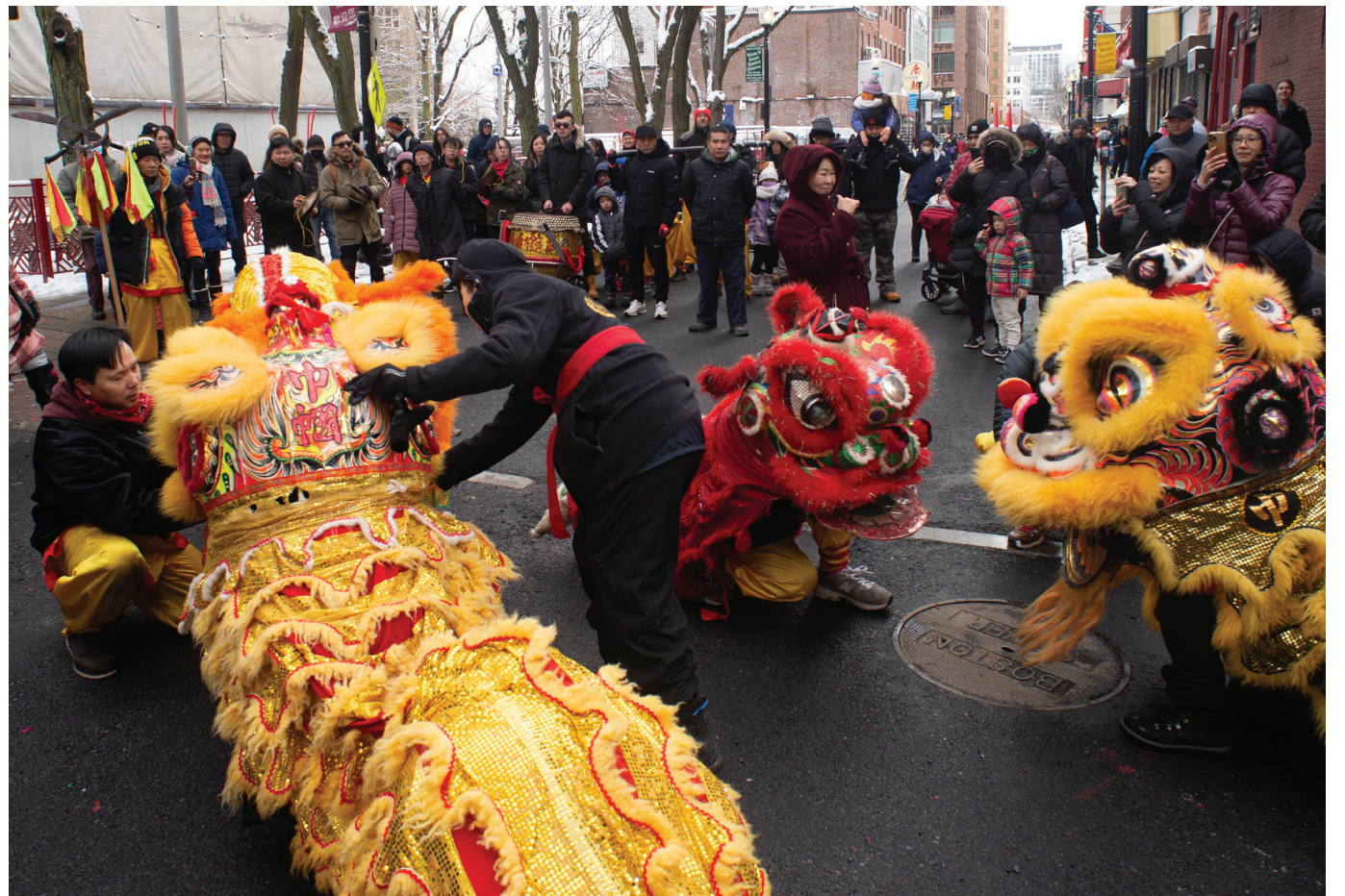
IN COSTUME: The lion dances in Chinatown earlier this month.