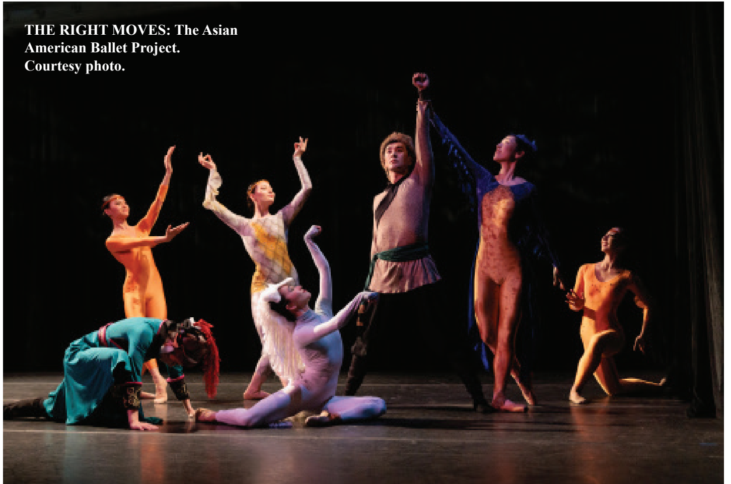
THE RIGHT MOVES: The Asian American Ballet Project.

lieves, when all-Asian American artists come together, the labels behind identity suddenly disappear.