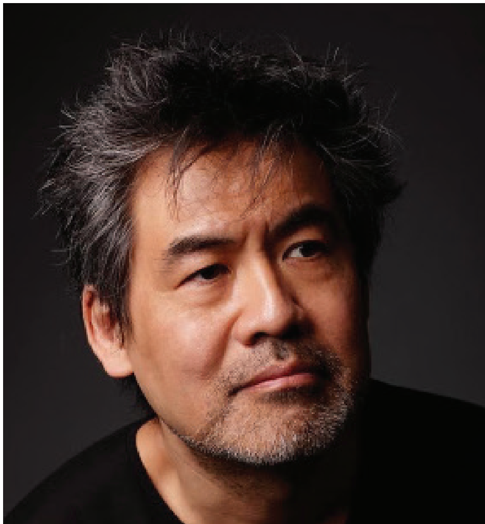
AHEAD OF HIS TIME: David Henry Hwang.

He added that seeing the artistic choices made by directors is one of the reasons he is a playwright. "I love the collaboration process, and I really enjoy the different kinds of interpretations and varied ways to manifest a story physically that directors are able to bring to the process. Occasionally I see an interpretation that I don't know that I agree with or a lot of times it may not be what I thought of initially, but I usually like it. Occasionally I see something that's different. I'm like, 'I don't really know about that', it's still thrilling to me that somebody and a whole company of creative people, as well as a theater in most cases, decided to put to do the show and that this is another way of looking at it, even if it's not one that I personally would agree with. In some sense, the