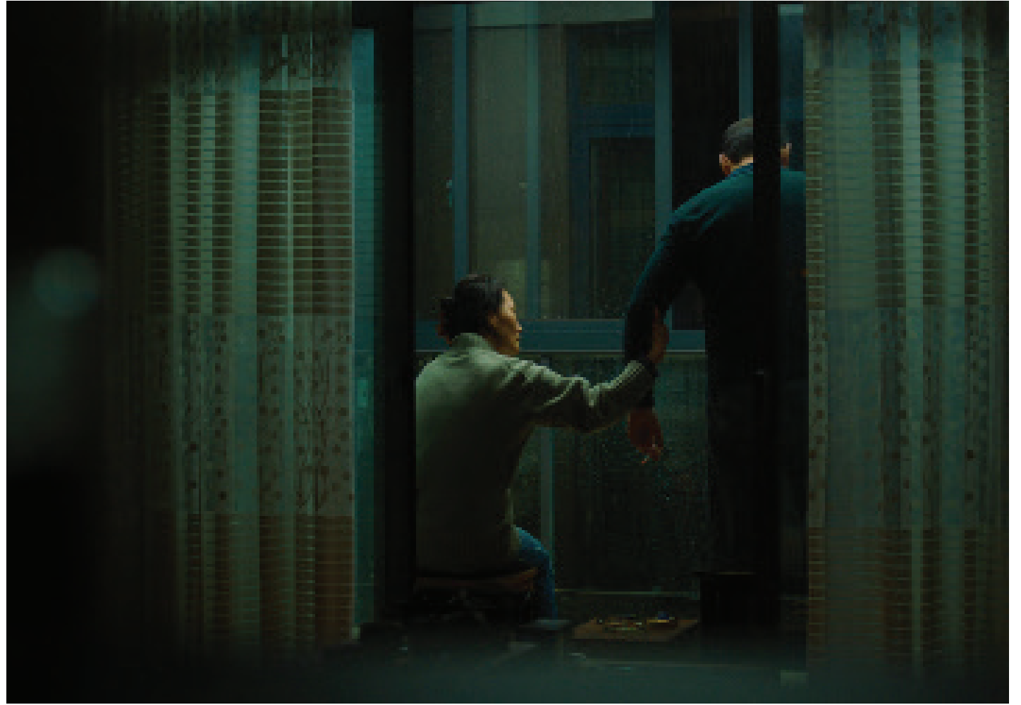
'Some Rain Must Fall'

Sampan: "Some Rain Must Fall," like many of your previous well-known