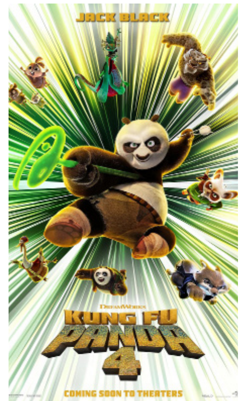
Kung Fu Panda 4

The voice acting was strong in this installment of Kung Fu Panda with Viola Davis bringing a powerful performance as The Chameleon. Awkwafina voiced the wily fox, Zhen, and made for a great side kick. The highlight of the film for me were Po’s two dads, who are not a couple--a panda named LI Shan (voiced by John Cranston) and a goose named Mr. Ping (voiced by James Hong) who both care very much for their son, enough so that they follow him into Juniper City and fall into many hijinks during the search.