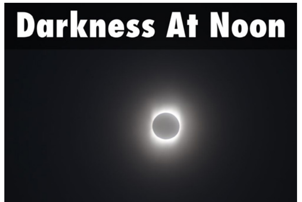
Photo of Darkness At Noon

some cases, this could also mean manipulating the populace's fears to serve broader political or religious agendas, shaping the social and cultural fabric of their communities. The interplay between fear, lack of understanding, and the interpretive power of spiritual leaders illustrates a complex dynamic where natural phenomena were intertwined with the socio-political and spiritual life of ancient civilizations.