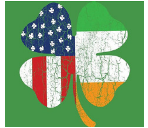
Photo of Irish American Heritage Month grant group has often joined the populace. Social Psychology theory reminds us that race will slow down the assimilation of an immigrant group into the populace

New immigrant groups replace old immigrant groups. New immigrant groups deal with the discrimination, the isolation, the anger, the hate and the fear from the populace. The irony is that the last immi-